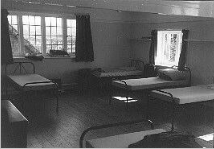
One of the boys' dormitories on the north-east corner of the house - sparse wasn't the word!