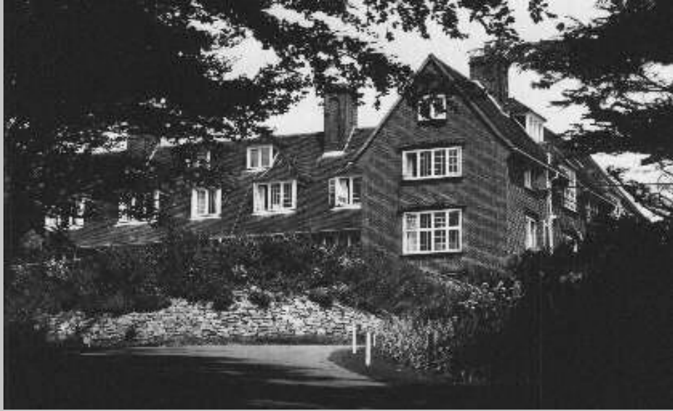
The south side of Oldfeld House.