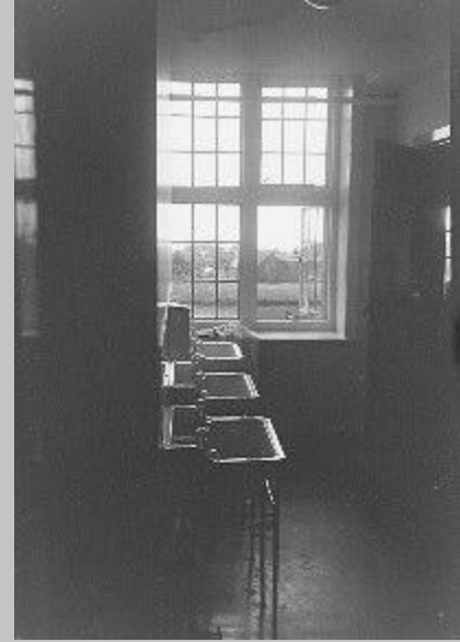
One of the boys' bathrooms, overlooking Forres School, the sea and the rising sun.