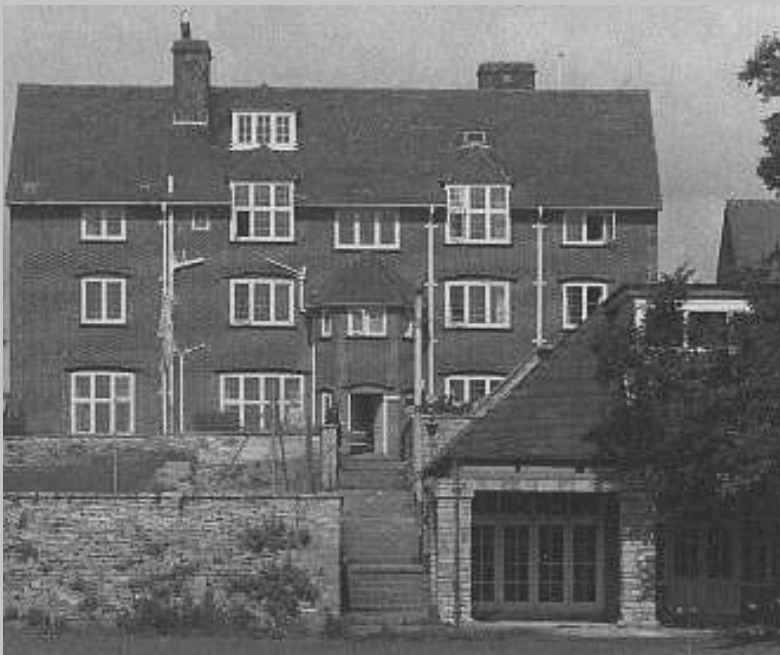
The east side of Oldfeld House and the main entrance door. Below right is the grammar school woodwork room, above which was the Arts and Crafts, or Playroom used by Oldfelders in wet weather. On the left is the raised tennis court.